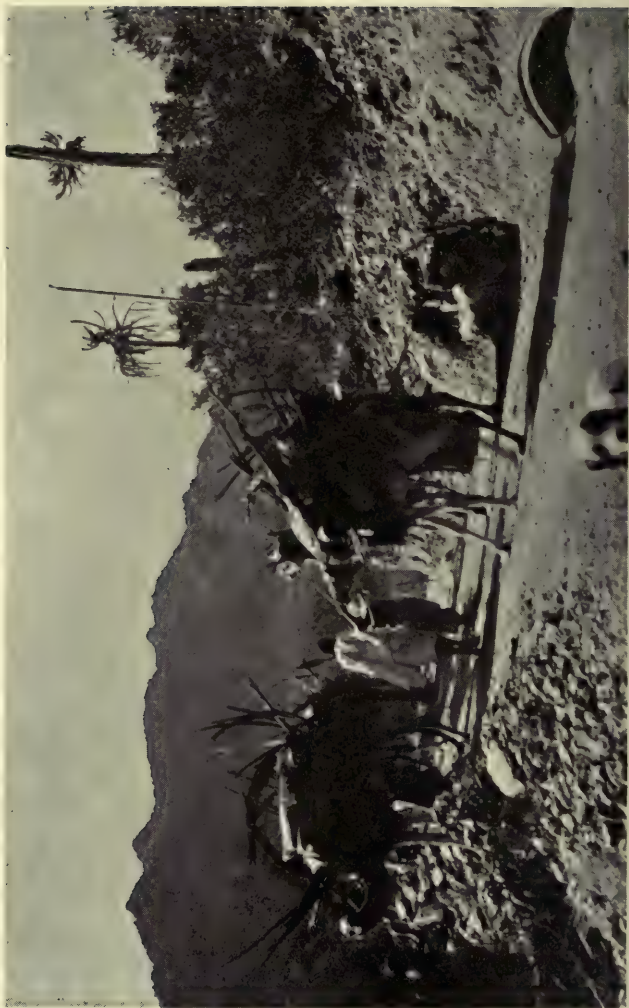
A SOMAL HOUSEHOLD ON THE MOVE.